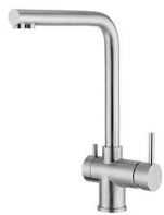
Mixer Tap Gamma 3 vie - satin 8496 100