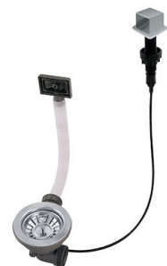
LIRA automatic waste fitting 8407 103