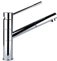
Mixer Tap Lorenzo 8466 000