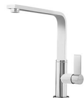
Mixer Tap NYC 8486 000