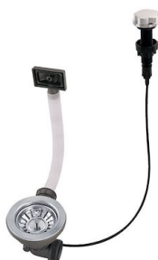
Automatic waste fitting 8407 000